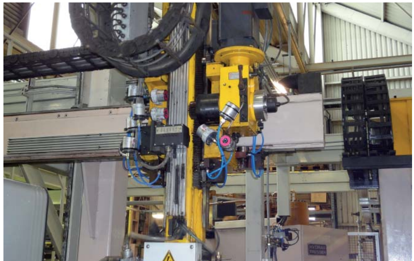
Image left and right: The lubricant is guided to the lubrication point by a tube.

Control shaft and track of a loading system lubricated by simalube 60ml units.