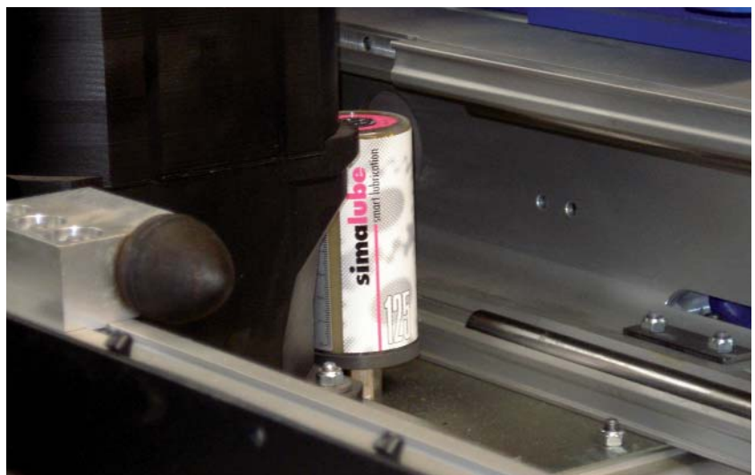
The end of a track on a double column loading system is lubricated by a simalube 125ml.