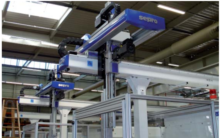
simalube lubricates an unloading-robot on a plastics injection machine from Sepro.