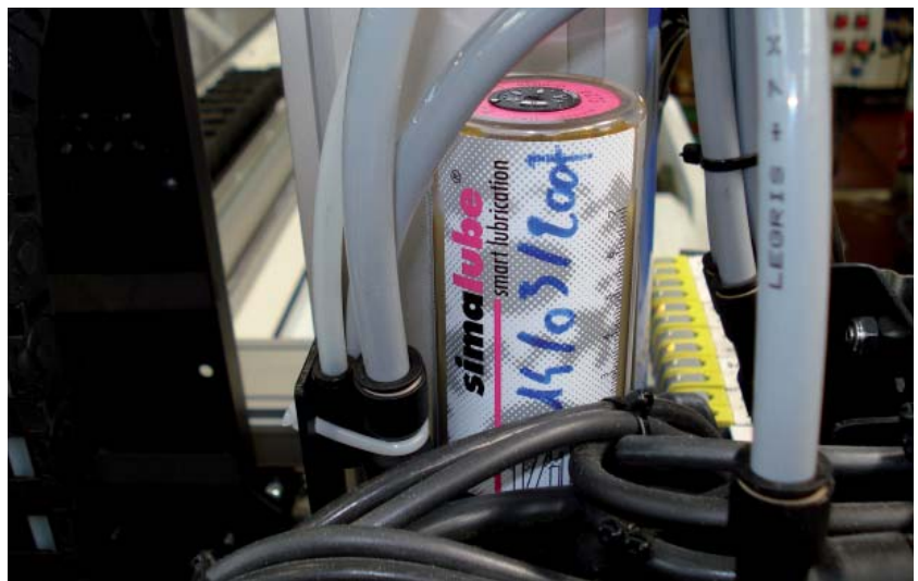
Detailed image of a simalube 125ml on a double column loading system.