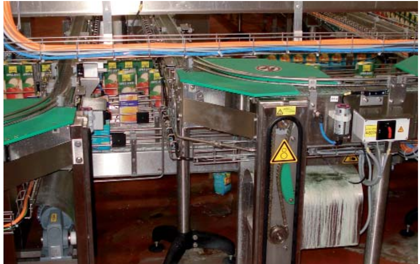
The Meurer Conveyor System lubricated by simalube.