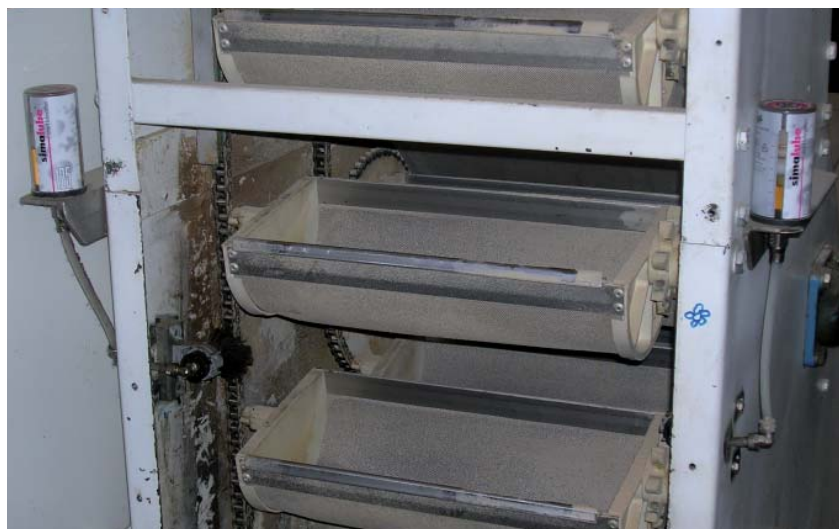
Lubrication of a chain on a conveyer. The oil is fed through the tubes to the brushes.