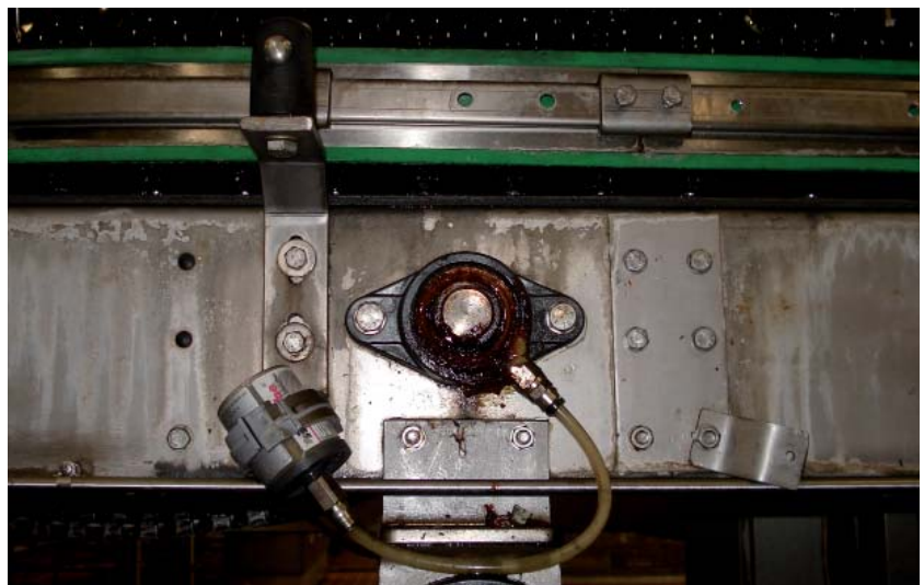
Lubrication of a flange bearing: Grease is pressed from the lubricator through a tube to the lubrication point.