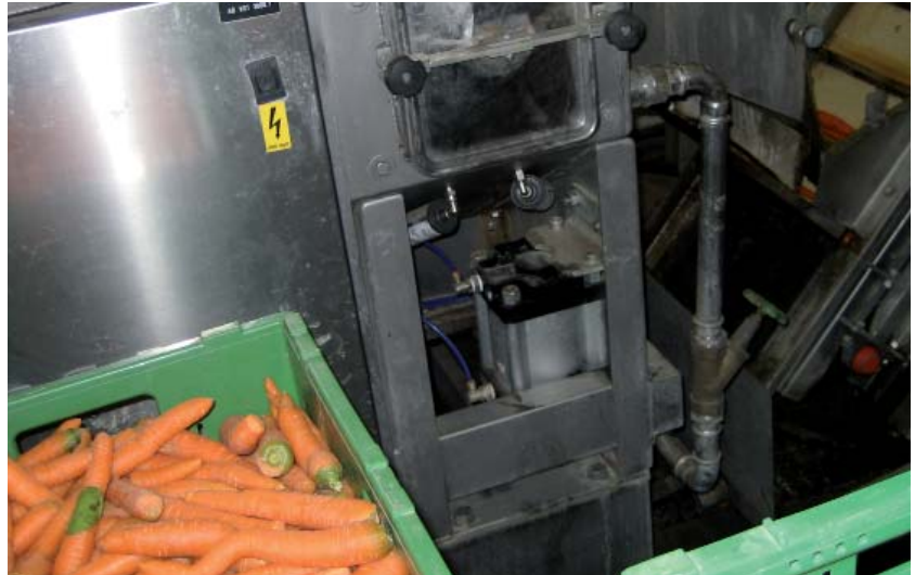
Lubrication of a bearing on an industrial vegetable washing station.