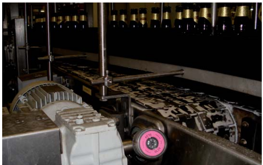
Lubrication of a flange bearing on a conveyer used for the transportation of bottles.