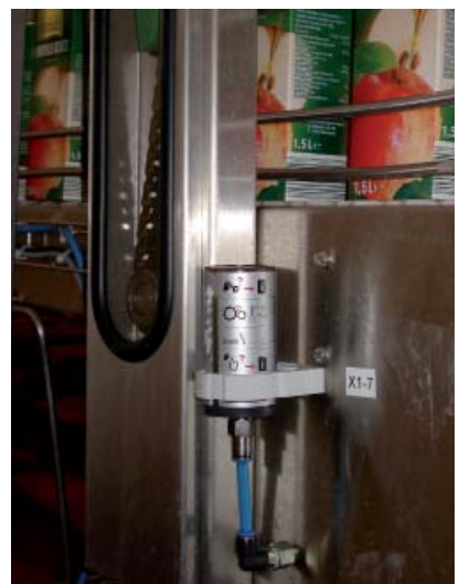
Image left and right: simalube lubricators mounted to the outside of a machine with a clamp.