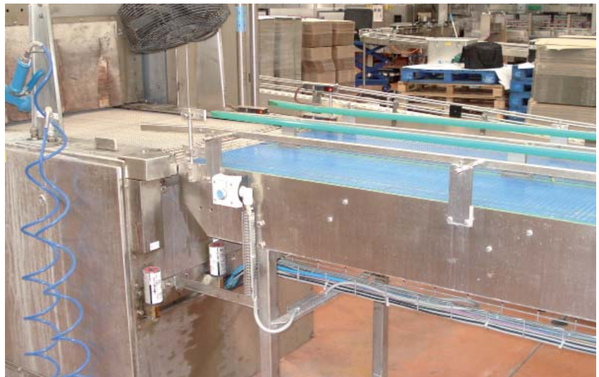
simalube lubricator filled with oil, which is used to lubricate a chain.