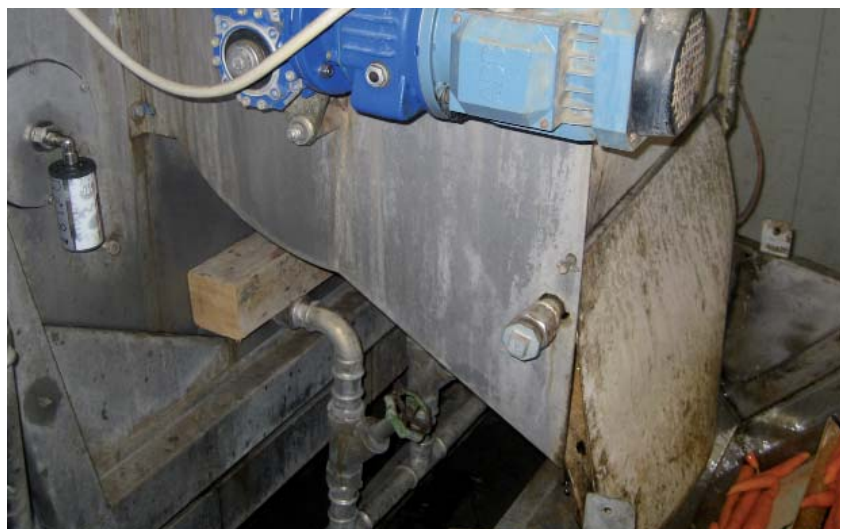
simalube installed with the accessory material „Bent connection 90°“.