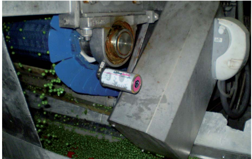
Lubrication of a vertical bearing on a produce cleaning station for peas.