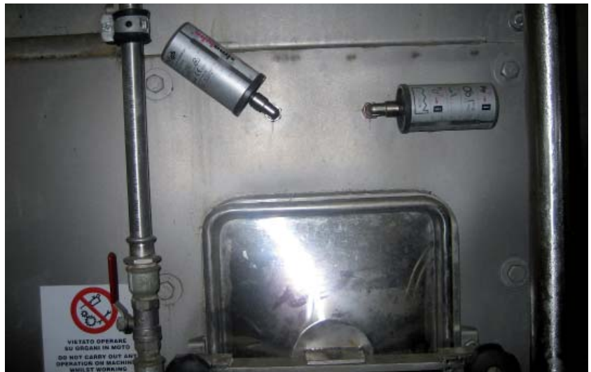
Lubrication with the NSK compliant organic grease SL14.