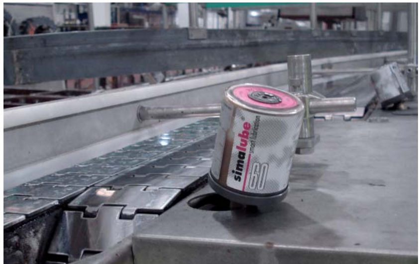
Image left: gear lubrication. Image right: lubrication of a chain on a pallet conveyer.

Lubrication of a bearing at the point of deviation on a conveyer system.