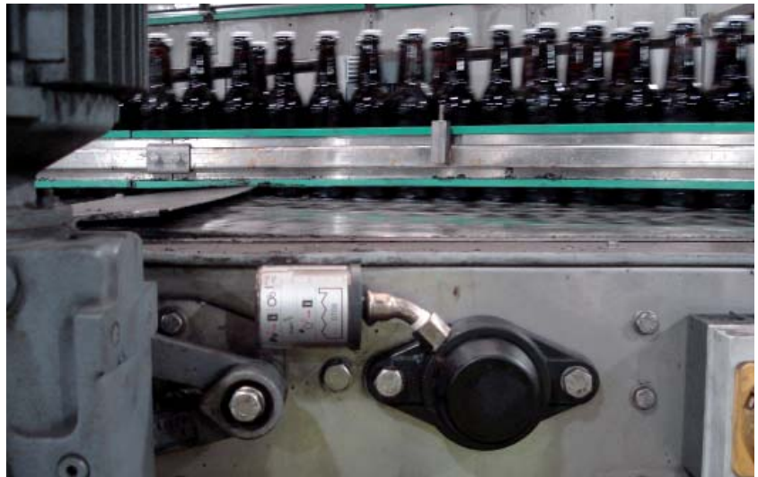
Lubrication of a flange bearing in the beverage and bottling industry.