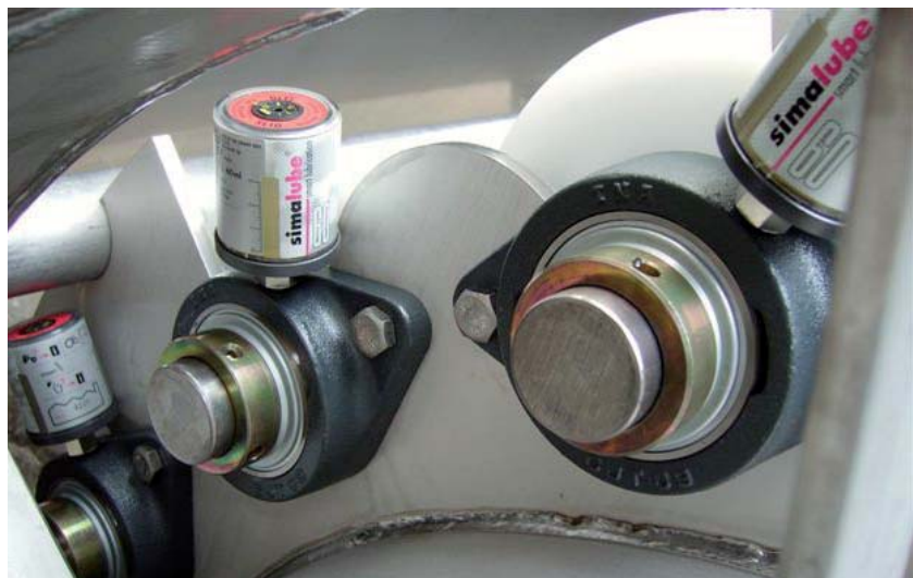
Lubrication of a vertical bearing with a 60ml lubricator, which is attached directly to the bearing.