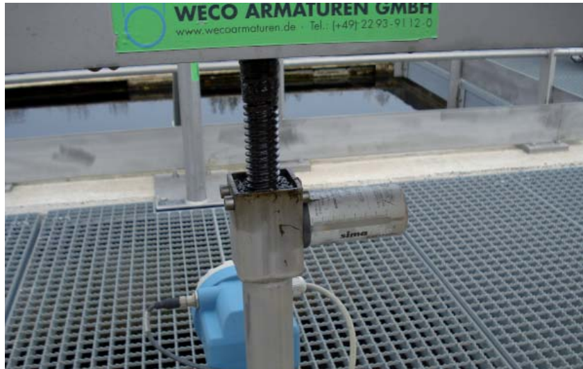
Trapezoidal spindle being lubricated with simalube.