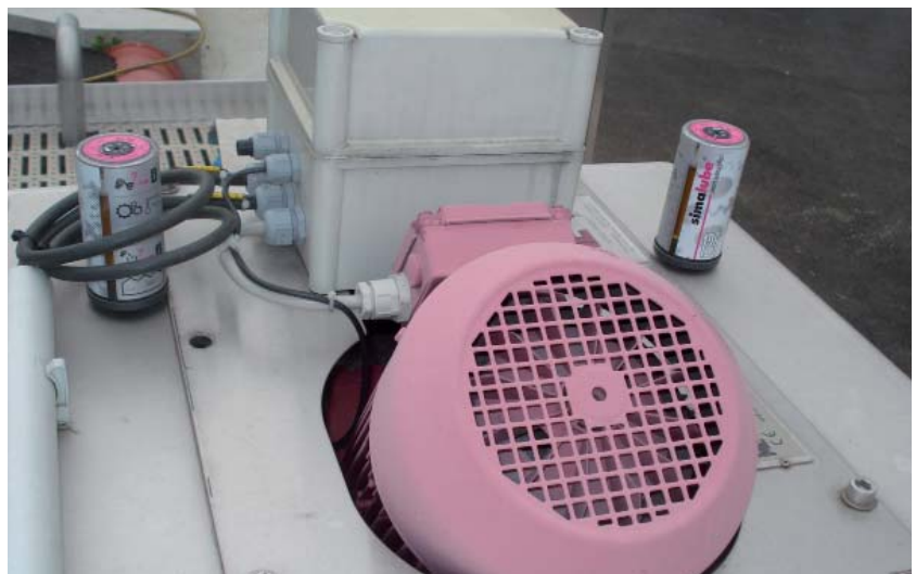
The lubricators are installed on the outside of the housing. The grease is being led to the chain through a tube.