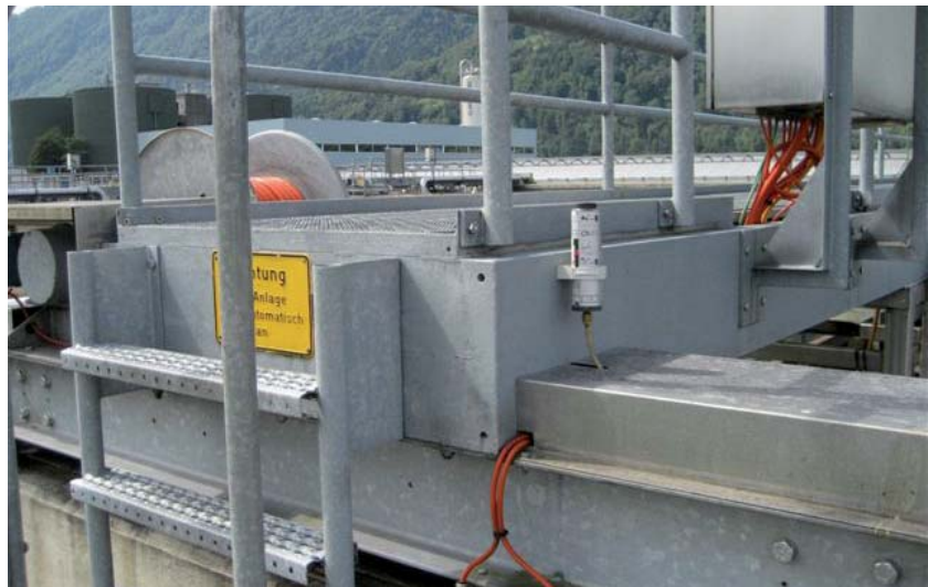
Lubrication of a bearing on a rotating bridge.