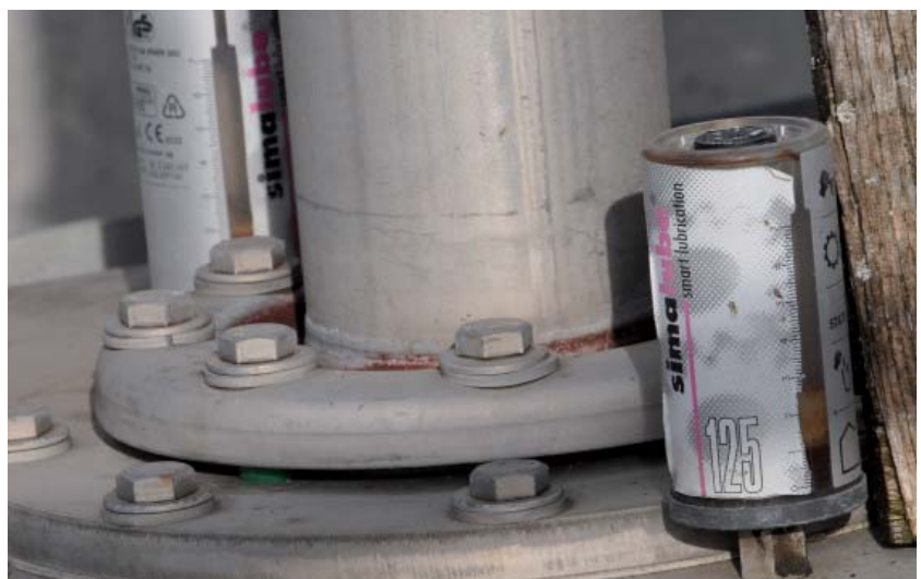
Detailed image of a mechanical agitator being lubricated properly with simalube.