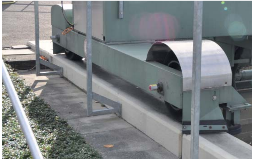
Bearing lubrication of a sludge-scraper-bridge.