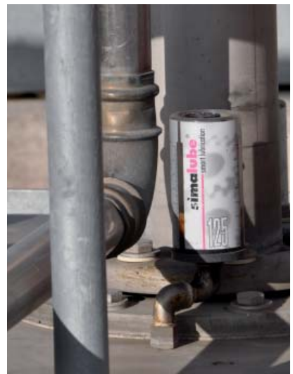
Image right: Lubrication of a bearing on a mechanical agitator. The grease is being fed inwards from outside.