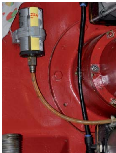
Image left: Bearing lubrication on a shredder. Lube connection linking the lubrication and the lubrication point.