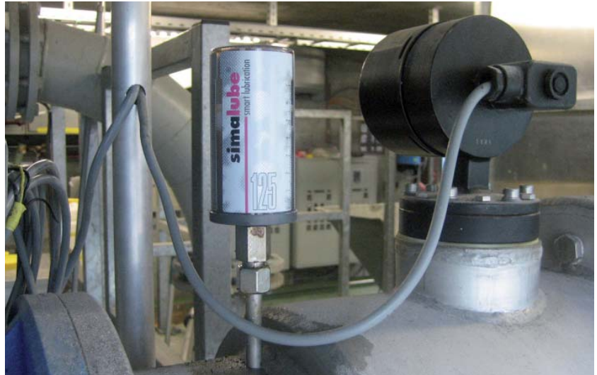
Bearing lubrication: The lubricant is being led through a short tube to the relevant bearing.