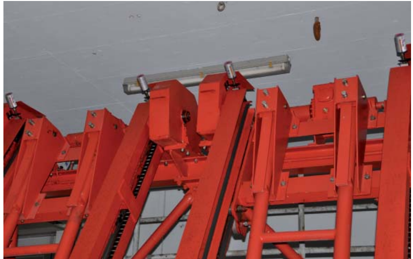
simalube fortified with brushes on a coarse rack at the point of lubrication.