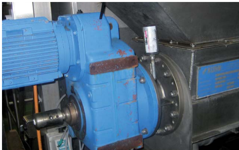
Lubrication of a primary axle on a shredder.