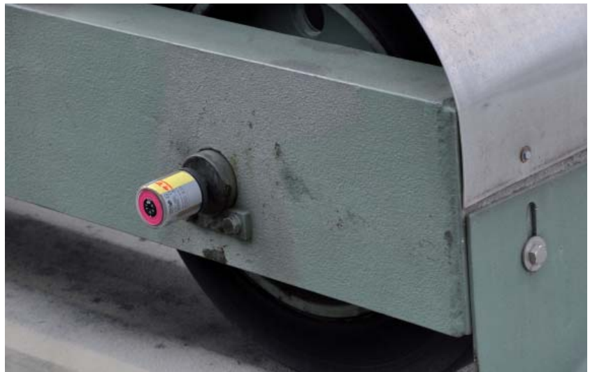
Detailed image of bearing lubrication on a sludge-scraper-bridge.